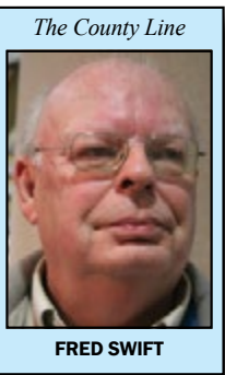
The County Line

Solar energy appears to be a big part of future electric power production. Will Hamilton County be in the lead in making use of this technology? Right now it's in the hands of the County Council which has had a request for funding a solar system since June. County Commissioners have asked the Council to approve spending about $8 million on solar panels and equipment that will convert collected heat to electric power for supplying lighting, heating and air conditioning at the county Corrections Complex and Health Department. Advocates of solar power make a strong case for this seemingly stable source of energy. Other governmental entities including the Indianapolis Airport, Sheridan Schools, Ben Davis Schools and the City of North Vernon