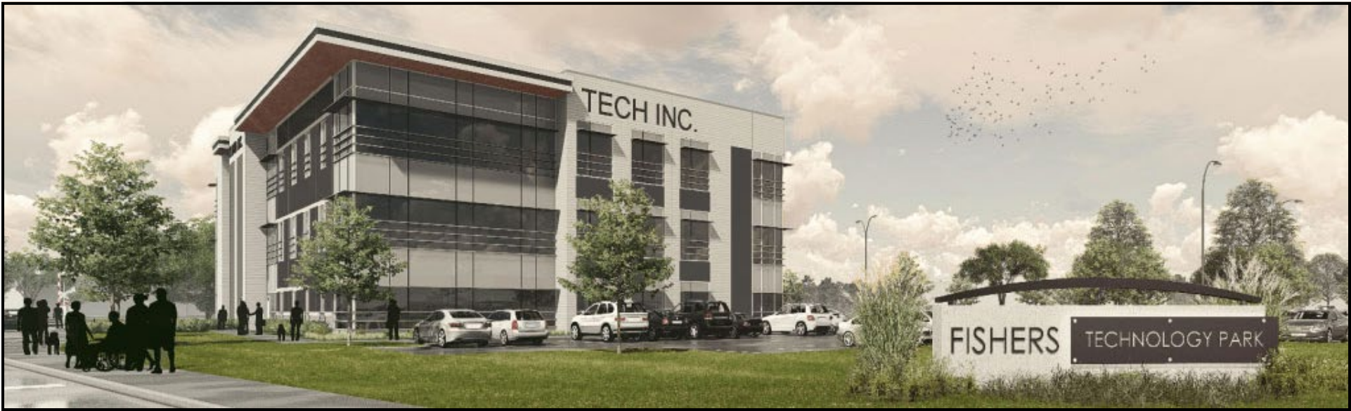
Artistic rendering provided by the City of Fishers This new suite of offices totaling 31,000 square feet will be located at 8939 Technology Way in downtown Fishers across from the Mayer Najem building.