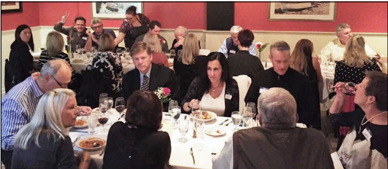
If history is any indicator, tickets for the third annual Chaucie's Place fundraiser will disappear fast.