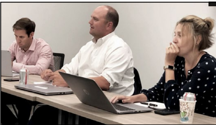
Mayor Scott Fadness (center), along with Deputy Mayor Elliott Hultgren (left) and City Controller Lisa Bradford (right) review the 2020 budget with the City Council Finance Committee. get details take shape. A public hearing will be held by the City Council on the budget in September, with the final vote on next year's city spending to be held in October.

to pay for needed street repairs in some older neighborhoods. Fadness is proposing a 2 percent increase in pay for city workers next year, while increasing the city match for employee contributions to the city's retirement plan by $500 a year per employee. The city is proposing no increase in the employee's share of health insurance premium costs in 2020. The city projects $2.2 million will be collected in 2020 from the Wheel Tax on vehicles registered to Fishers residents. The mayor also told the committee the General Fund will have $16.4 million in the bank, as cash reserves, heading into the start of 2020. The Finance Committee plans more meetings as the bud-