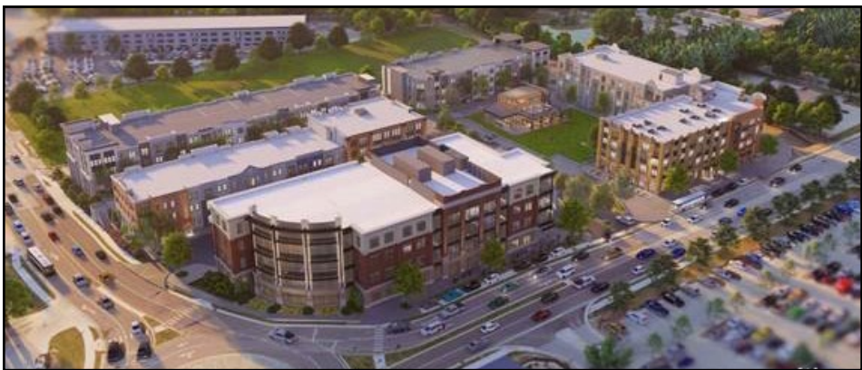
Rendering provided Site plan for the Proscenium featuring the Agora, multi-family and for sale residential, restaurants, retail, a central gathering green and below ground parking.

“To have the building more than 60 percent pre-leased prior to commencing construction validates our decision to develop this facility in Carmel. The benefit of walkability to amenities provided both within downtown Carmel and within the Proscenium development