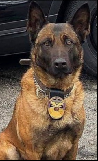
Fishers Police K9 Harlej.