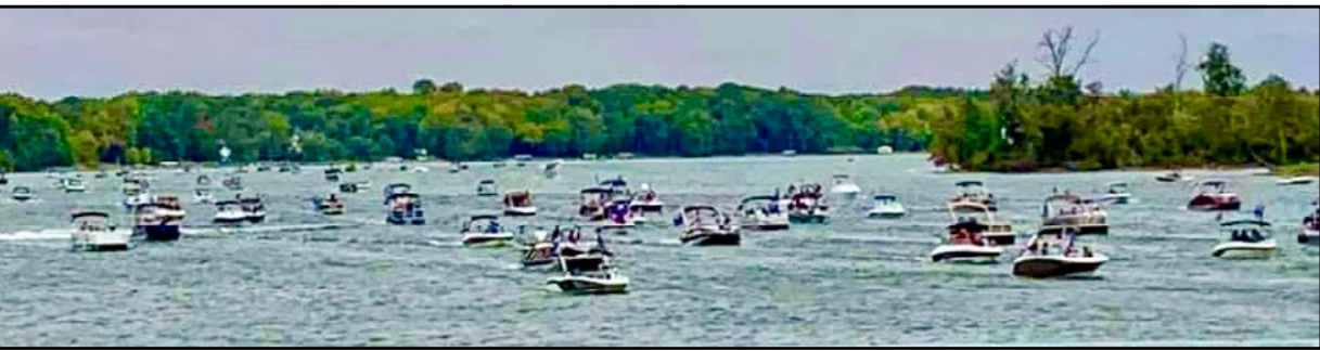
On Sept. 12 a patriotic boat parade was held on Geist Reservoir. Over 500 boats filled with people participated and stretched out over 1.5 miles on the reservoir. Several hundred people gathered on the bridge with signs and American flags. Jai Baker 3 entertained non-boaters with live music at Wolfies.