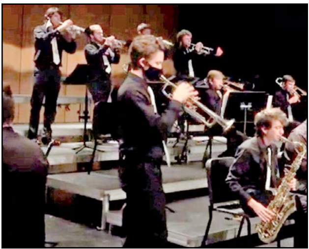
Noblesville High Schools Jazz 1 class students are part of an elite group participating in this year’s virtual “Jazz Superbowl” competition hosted by Wynton Marsalis.

Noblesville Schools announced last Monday that it has been named a 2021 Best Community for Music Education winner by the National Association of Music Merchants (NAMM) Foundation. This is the sixth consecutive year Noblesville has earned the honor. Highlighting the district’s strength in music, the Noblesville High School Jazz 1 class was recently accepted into the highly selective “Essentially Ellington” jazz competition, also known as the “Jazz Superbowl.” NHS earned a spot given to only 15 schools across the United States and Canada. This June, students will perform in the virtual competition, based in New York City and hosted by jazz legend Wynton Marsalis. The national music education recognition highlights school districts for their out-