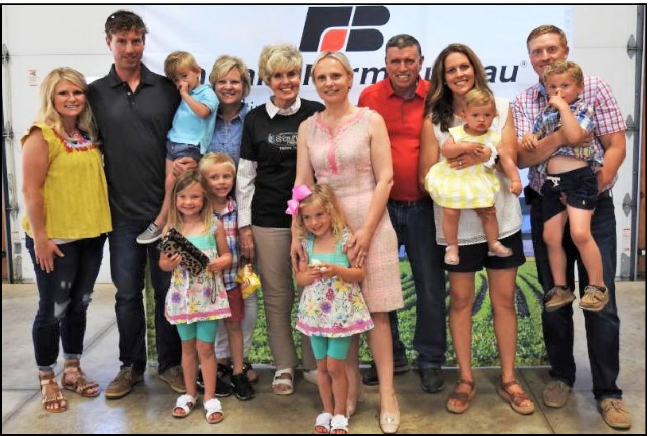
Rep. Spartz visits with representatives from Stafford Farms, a fourth-generation farming operation that produces corn, soybeans, wheat, contract seed corn, and contract seed beans across four Indiana counties. They also run a hog operation at their Tipton location.