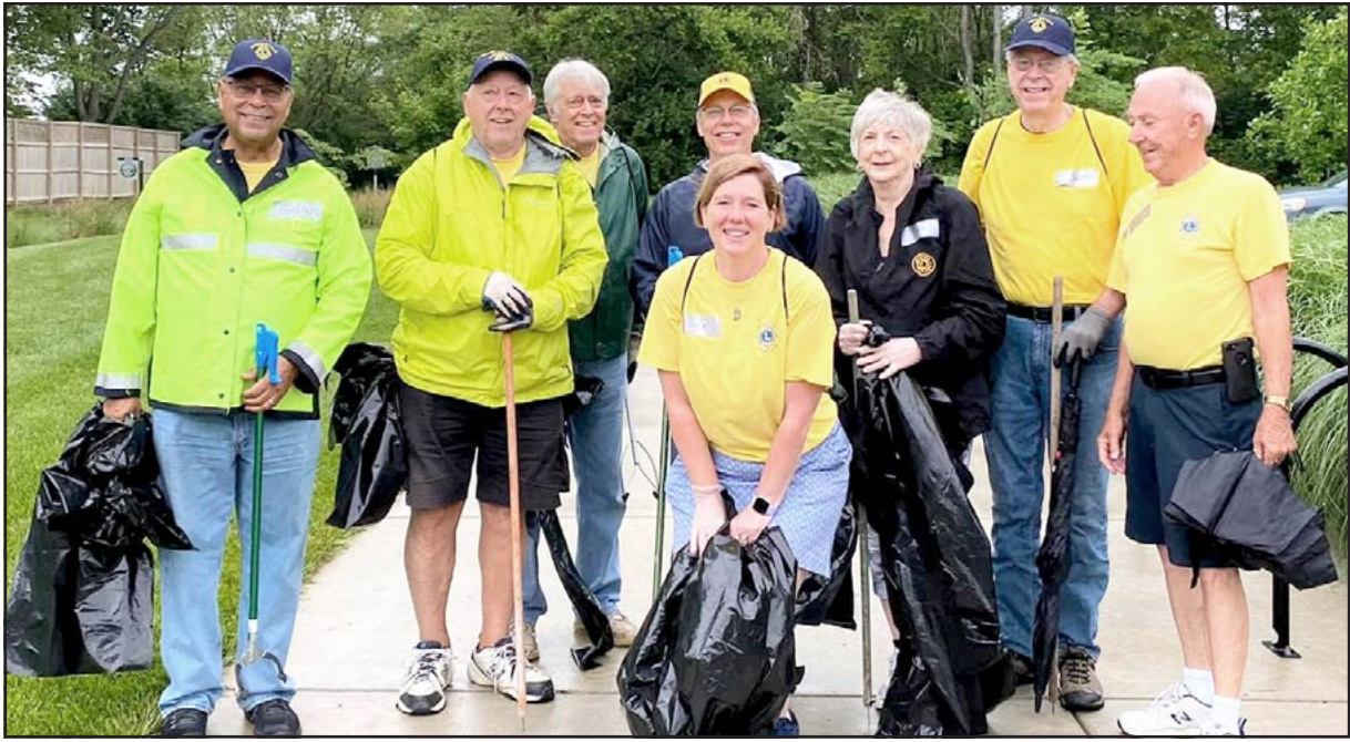
On June 25, the Noblesville Lions Club gathered and picked up trash along the Midland Trace Trail. Good job, Lions! It's community members like you who make Hamilton County great!