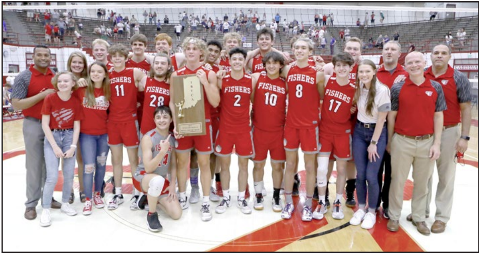
The Fishers boys volleyball team defended its state championship, beating Roncalli in four sets on May 22 at Southport High School. The Tigers finished the season 41-1 with an experienced group, as 10 of the 16 players were seniors.

The tournament began with the regional round on May 15. The Tigers swept through their regional, beating Lawrence North in the semi-finals and Brebeuf