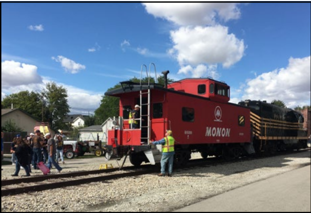
The Nickel Plate Express ran numerous 15-minute Caboose rides at the festival Saturday and Sunday. If you'd like to ride the train, go to NickelPlateExpress.com for tickets and info.