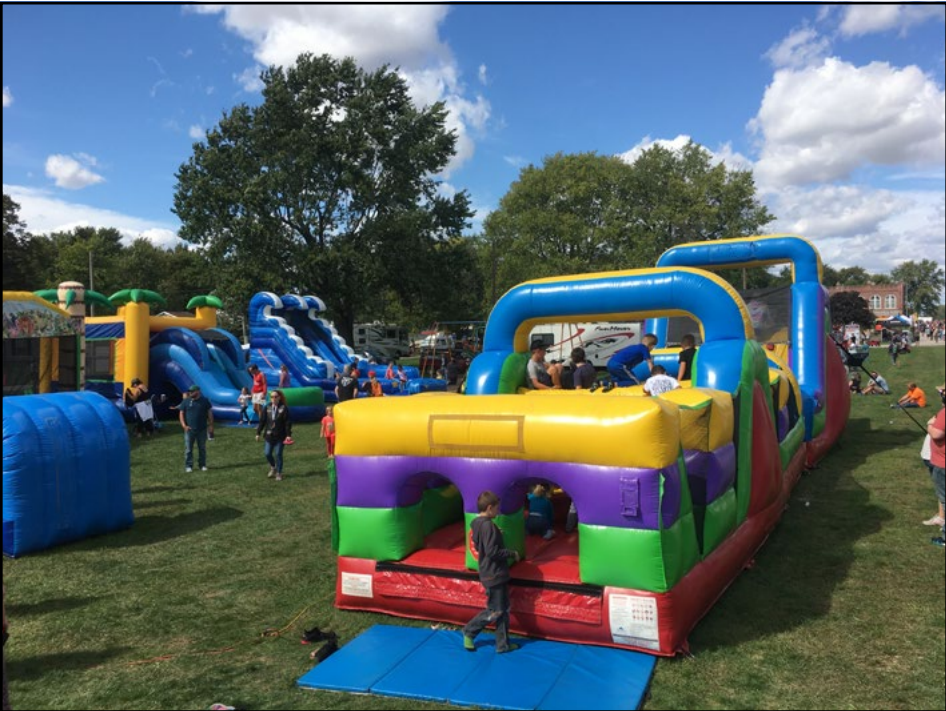
(Above left) The crowds Saturday were so large that many food vendors reported that they completely sold out and had to restock for Sunday. (Above right) The kids zone in Dolles Park is always a popular attraction, and this year was no different.