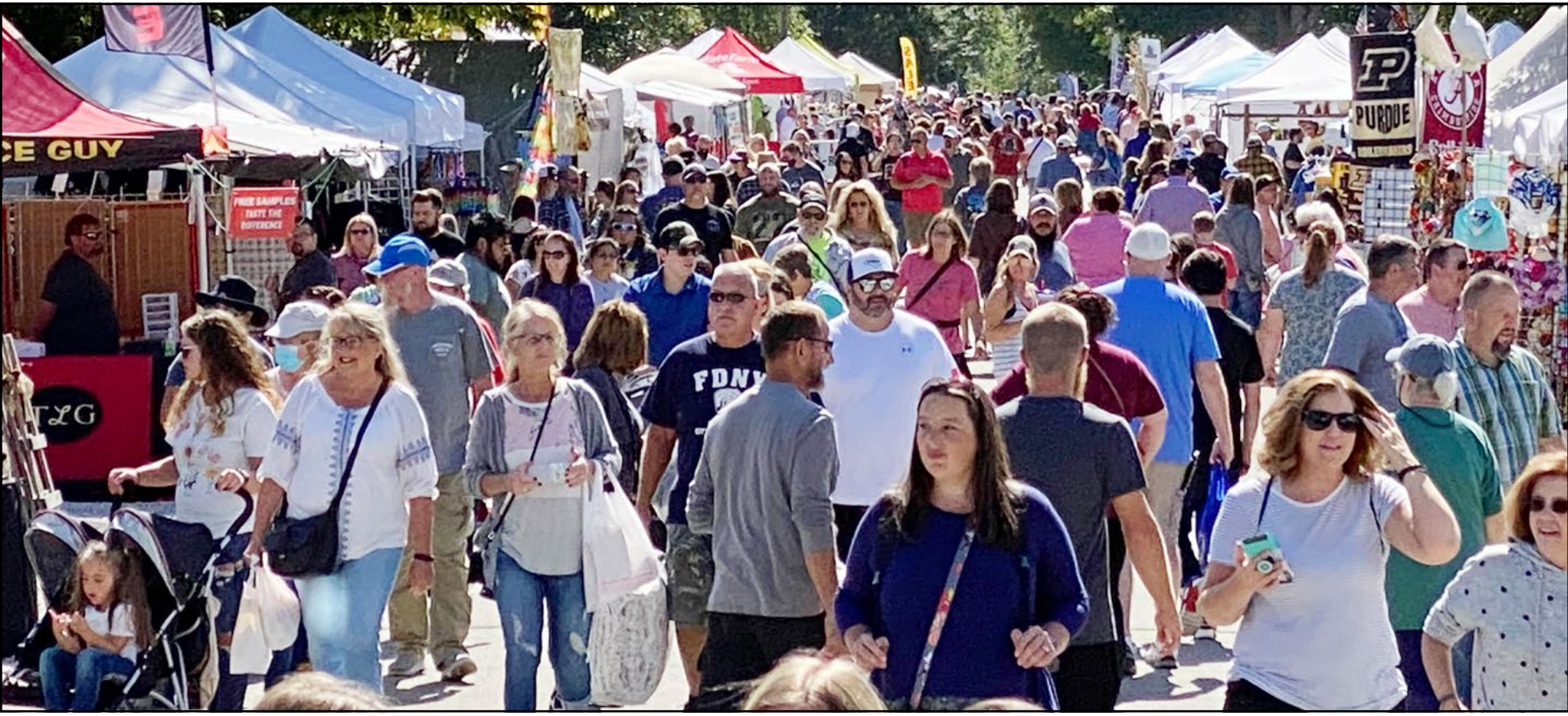
Early reports indicate as many as 80,000 people flooded the streets of Atlanta this past Saturday and Sunday for this year's New Earth Festival.