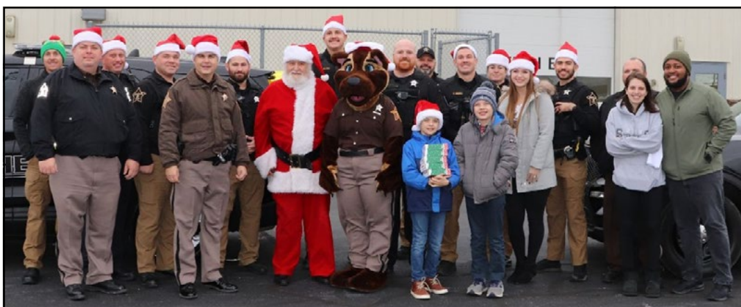
The HCSO Foundation was able to bring bags full of toys to 55 local children this year.

The stockings were packed by the Foundation with care, in hopes that St. Nicholas and the Hamilton County Sheriff's Office staff would soon be there.