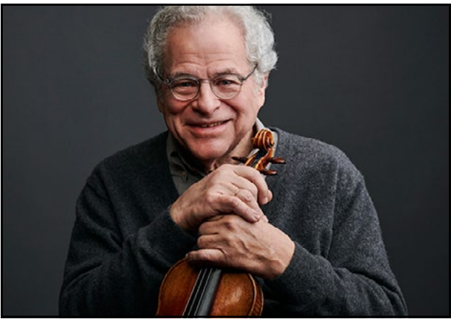
World-renown classical violinist Itzhak Perlman will play The Palladium on Saturday, April 9.

About the Museum The Cleveland Museum of Art was founded in 1913 “for the benefit of all