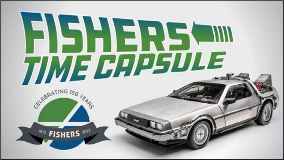
Graphic provided by City of Fishers