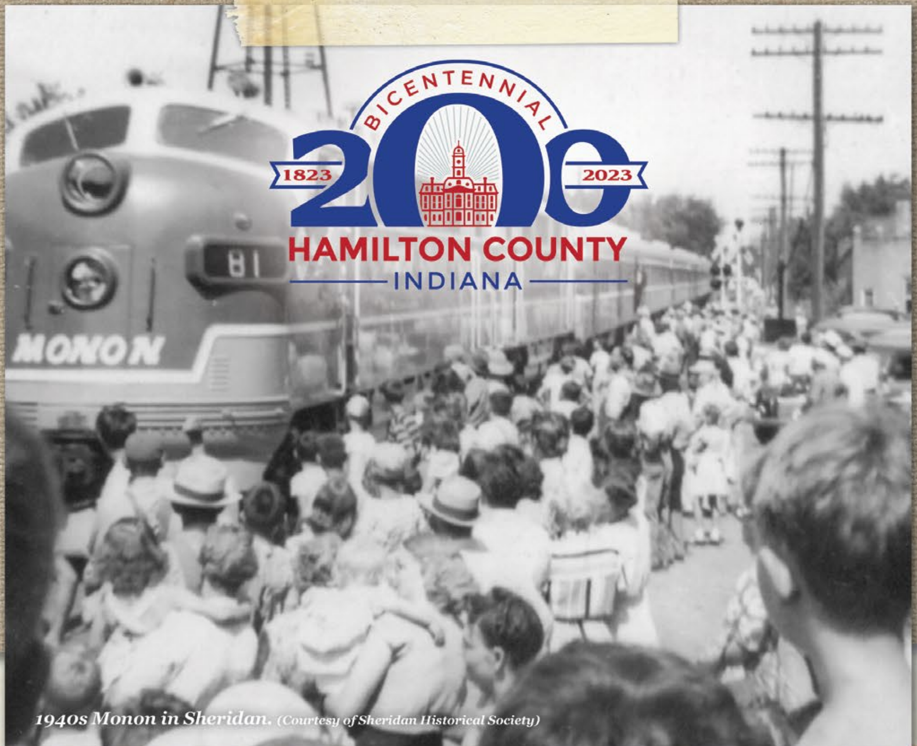
1940s Monon in Sheridan.

Draw a Crowd for Hamilton County's 200th Anniversary