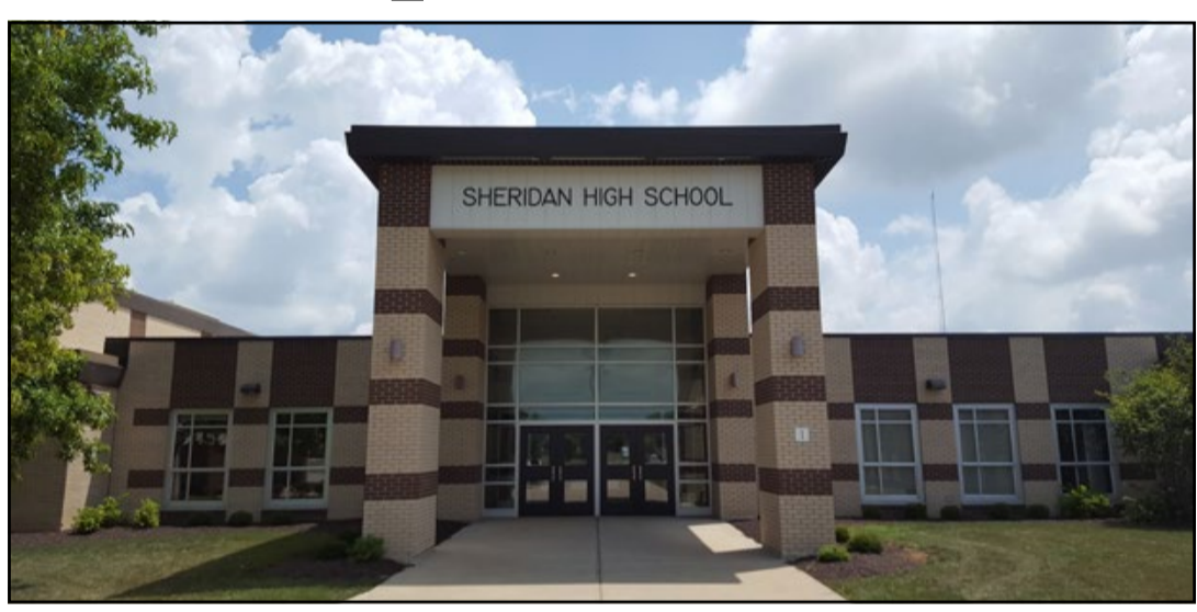
Sheridan High School earned this designation by being placed the highest performance and improvement category by the Indiana Department of Education.

The REPORTER The Indiana Department of Education (IDOE) has announced that Sheridan High School has maintained its identification as a performance-qualified high school for the 2023-2024 school year. IDOE implemented this valuable recognition to honor and distinguish schools that have consistently demonstrated exceptional performance and achievement in various educational areas. By granting this prestigious title, the IDOE acknowledges the commitment and efforts of these schools in providing an outstanding learning environment for their students. The primary criterion for achieving the High-Performance High School Designation is academic excellence. Schools must exhibit sustained high achievement across multiple indicators, including standardized test scores, graduation rates, and college readiness measures. By meeting or surpassing these benchmarks consistently, Sheridan High School has established