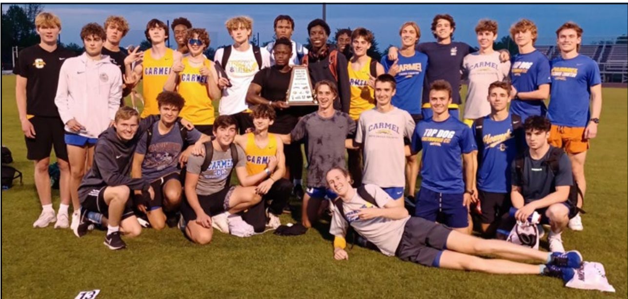
Carmel won the Hamilton County boys track and field meet Thursday at Guerin Catholic. The Greyhounds scored 143 points and won seven events.