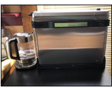
Our columnist's new space-saving appliance is taking her to new levels of happiness.