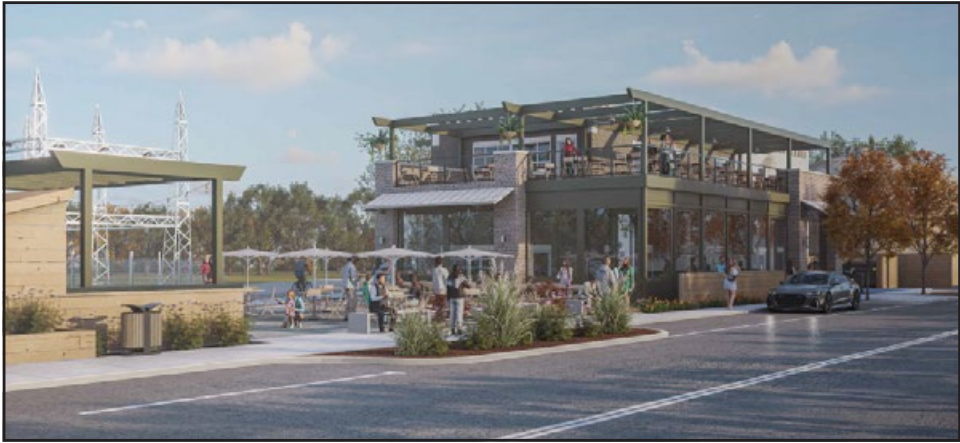
This artist's rendering shows the future King Jugg Brewing Company, looking north along 8th Street.

King Jugg Brewing Company has committed a minimum $4 million investment into adaptive reuse of the site and building, along with significant economic impact and community involvement commitments. Subject to required approvals, the Noblesville Redevelopment Commission will lease the property to