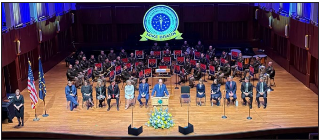
Governor Mike Braun speaks to the crowd assembled at Hilbert Circle Theatre in Indianapolis during his inauguration ceremony held Monday morning.

The inauguration of Governor Mike Braun and Lt. Governor Micah Beckwith was held Monday morning at Hilbert Circle Theatre, 45 Monument Circle, Indianapolis. Gov. Braun, Lt. Gov. Beckwith, and Attorney General Todd Rokita all took their oaths of office during the ceremony. Braun formerly served Indiana as one of its two U.S. Senators. Beckwith is a pastor and small business owner from Noblesville, and Rokita continues serving Hoosiers as the attorney general. The Braun Administration wasted no time getting down to the business of governing, with the governor issuing 10 executive orders on Day 1, Jan. 13. Most of the orders concern creation of the Governor's Cabinet and new departments for the cabinet secretaries — the pinnacle of Braun's efforts to reorganize