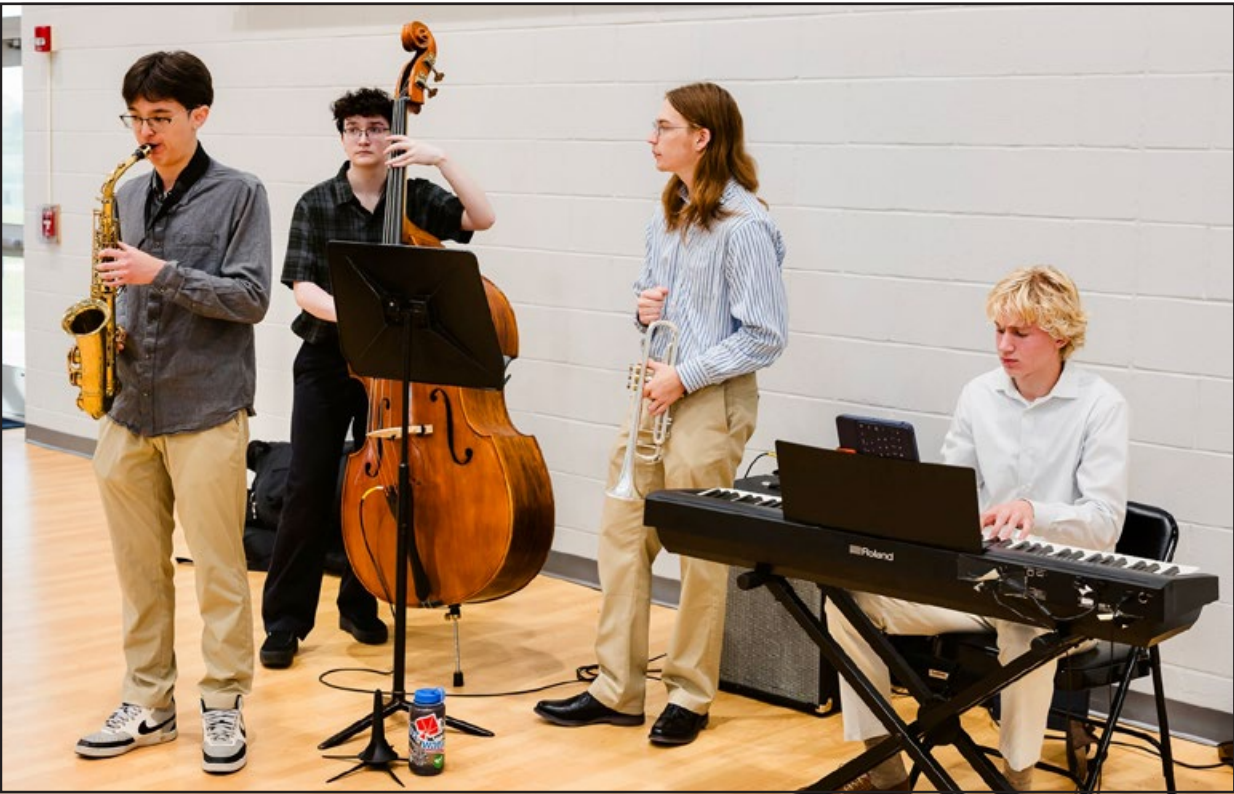
Noblesville High School (NHS) jazz and orchestra students have both been invited to perform on the national stage at upcoming events. The top NHS jazz band will open for the legendary Wynton Marsalis and the Jazz at Lincoln Center Orchestra for their performance at the Palladium on Sunday, Jan. 26. Click here for more information about how you can see the show. NHS was also the only orchestra in the state to land a spot in the prestigious 2025 Music for All National Festival. They will perform March 15 at the Palladium in Carmel. Click here for more information on this event.