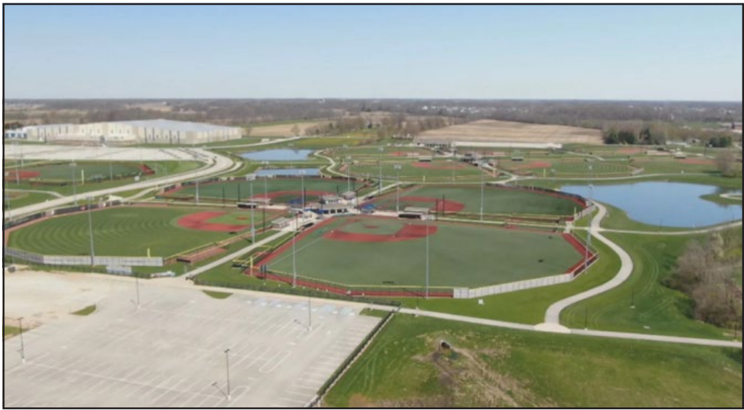
A view of Westfield's Grand Park Sports Campus.

Westfield city government on Monday revealed a plan for future development of the Grand Park Sports Campus that included a 10,000-seat stadium, a parking garage, more housing, and a hotel. The announcement came just over a month after Westfield City Council gave a private company control over the management of the 400-acre campus as a way to boost profits. A news release issued Monday night read, "Phase 1 will focus on the immediate construction of the parking garage, full-service hotel, and mixed-use development with apartments, retail, restaurants, and entertainment as well as an expansion of Indy Eleven's soccer operations headquarters that have been located at Grand Park for the last decade. Over the next six months, Keystone Group will continue working alongside city officials to refine the district's design, budgets, and schedules, focusing on creating a walkable, active, connected urban environment."