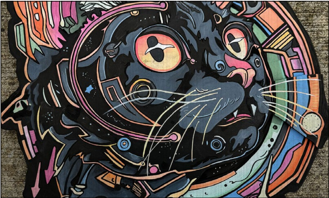
Graphic & Illustration: Sable Blaze by Gillian Wu