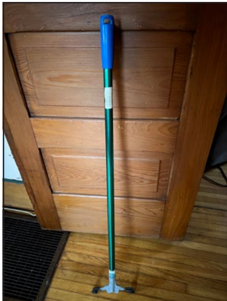
Our columnist discovered that the ‘grabber’ can be a lifesaver during certain episodes of middle-age.

wavering commitment to making Hamilton County a better place. Your contributions inspire everyone to lead with generosity and compassion.